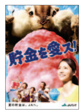
Campaign poster featuring the new JA Bank character "Chorisu"

responding to their diverse needs at different stages of their lives. In addition, through the expansion of our affiliated ATM networks and surcharge-free ATMs and the enhancement of our Internet banking functions, we are working to make it even more convenient for customers to draw their pensions, make direct salary deposits and use JA Cards.