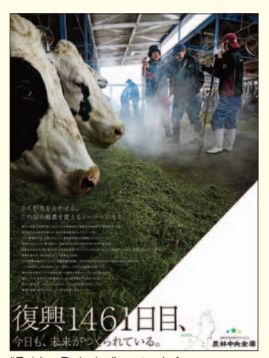
"Fukko Bokujo," a stock farm operated by some Fukushima farmers aiming for reconstruction

Four years have passed since the Great East Japan Earthquake, and the road to recovery is still long. Although we seem to be only half way through the completion of reconstruction, activities toward a new stage of reconstruction have been seen. The advertisement provides specific examples that introduce these new initiatives in the agricultural, fishery and forestry industries, as well as the roles that the Bank is undertaking in the recovery effort, and expresses the Bank's future-oriented resolution to continuously support reconstruction.