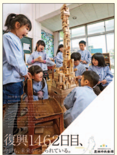
Donation of building blocks in collaboration with the Federation of Forestry Cooperatives in Fukushima Prefecture