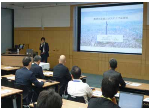
Mr. Fuma delivers a lecture at the Sustainability Workshop

Going forward, we plan to hold more workshops on sustainability with the aim of raising awareness among directors and employees.