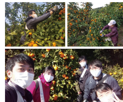
A snapshot at the mandarin orange farm

One harvest operation occurred in December 2021 at a mandarin orange farm in Fujieda City, Shizuoka, and the other was in March 2022 at a leek farm in Kasukabe City, Saitama.