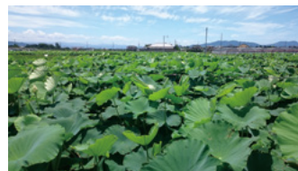
A farm field owned by the company

The Bank will continue to support the expansion of the company’s business and an increase in agricultural income (i.e., an increase in the added value amount) while following the progress and resulting effects of the formulated action plans.