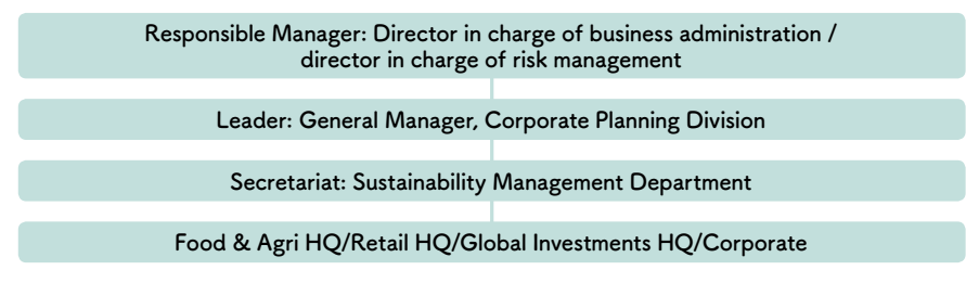
Diagram: CFT Structure