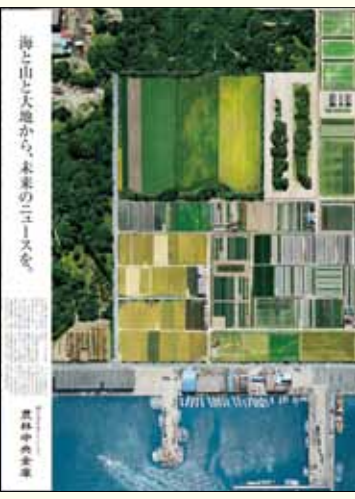
The Norinchukin Bank's corporate advertising

of human life to represent the connection between agriculture and people.