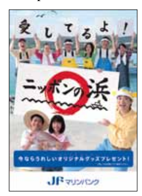
Nationwide campaign poster

We will achieve sound and efficient operation of JF Marine Bank by taking steps to ensure the effectiveness of the JF Marine Bank Safety System (Stable and Responsible JF Cooperative Banking Business System) so that individual members and customers can use JF Marine Bank with peace of mind.