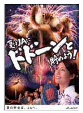
Campaign poster featuring the new JA Bank character "Chorisu"

stages of their lives. In addition, through the expansion of our affiliated ATM networks and surcharge-free ATMs and the enhancement of our Internet banking functions, we are working to make it even more convenient for customers to draw their pensions, make direct salary deposits and use JA Cards.