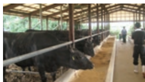
Cattle farm of a borrower of Agricultural Corporation Support Loan

In order to meet the short-term working capital needs of agricultural corporations, we started offering the Agricultural Corporation Support Loan beginning from April 2013.