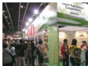
Hong Kong Food Expo 2013