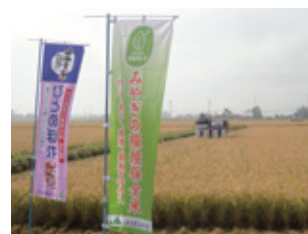
Harvesting rice from subsidized rice paddies