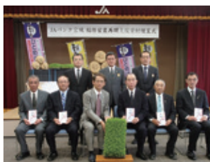
Subsidizing cost of production materials for rice cultivation

Directors and employees at the head office and branches and the employees sent to help disaster-affected members will continue to work as a team, and work toward disaster recovery in collaboration with the government and relevant organizations.