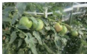
Tomato farm run by a borrower of the Support Fund for Business of Agricultural Leaders

*Cumulative total as of September 30, 2013