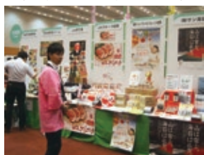
JA Group/JF Group Kyushu Business Conference

In the first half of fiscal 2013, a total of 50 business contracts were signed as a result of such conferences. The number of contract signing has totaled 261 since the inception of this initiative in fiscal 2009. Regional business conferences were held twice (in Nagano and Kyushu) in the first half of fiscal 2013, and they were highly rated by seller groups and buyer companies.